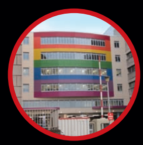
Connect up to 6 storeys Highly versatile

The bandwidth is 868mHz and the units are equipped with Class 1 receivers providing reliable connections between units