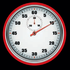
Very quick to install Save time, save costs

The weatherproof design is suitable for indoor and outdoor locations, and the units are powered by standard, readily available alkaline batteries.