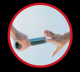
Wirelessly link 31 units No trailing wires