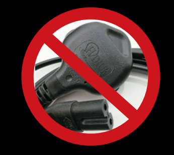
Fully battery operated system No mains power required