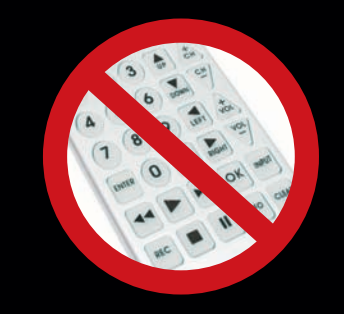
No control panel required Very simple to set up and use