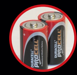
Off-the-shelf Alkaline batteries Low ongoing maintenance costs