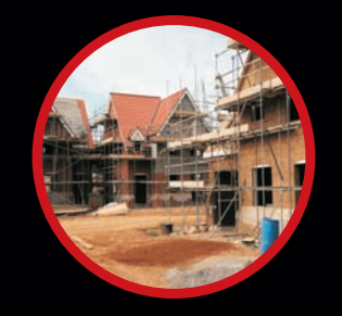
8 different channels For multiple building projects